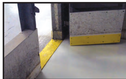
Synthetic ice installed on floor of players' box.