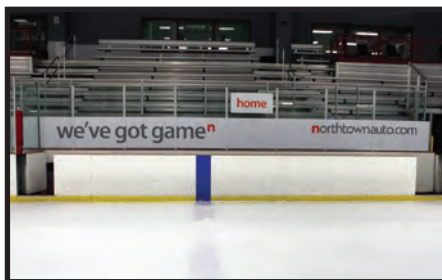
Players boxes before work started.