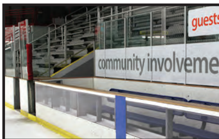
Installation of Polycarbonate.