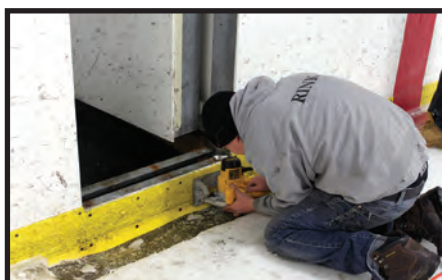
Work starts on cutting out player gate thresholds.