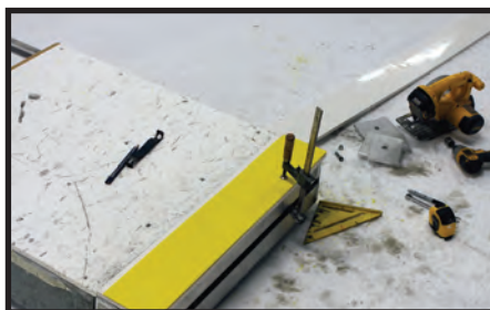
Installation of new gate lower extension.