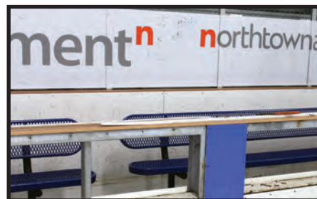
Upper portion of dasher board facing removed.